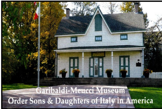
Garibaldi-Meucci Museum Order Sons & Daughters of Italy in America

Order Sons & Daughters of Italy in America Grand Lodge of California